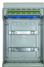
Integrated plug-in terminal technology for PE and N conductors.