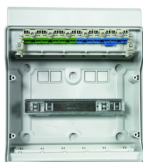
Integrated plug-in terminal technology for PE and N conductors.