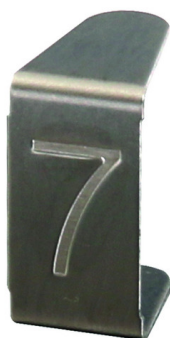
Figure without obligation